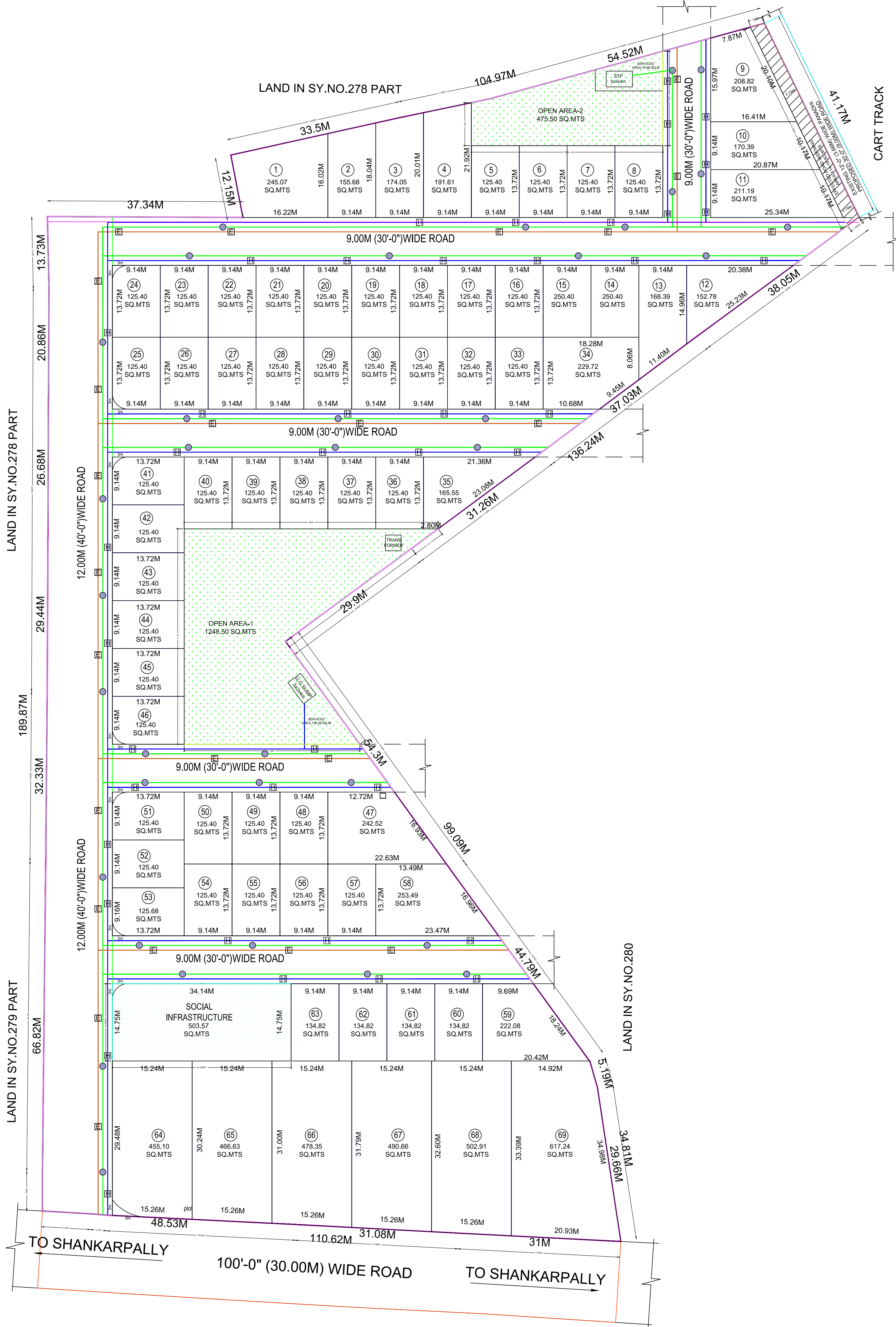
LAYOUT PLAN (SCALE 1:400)