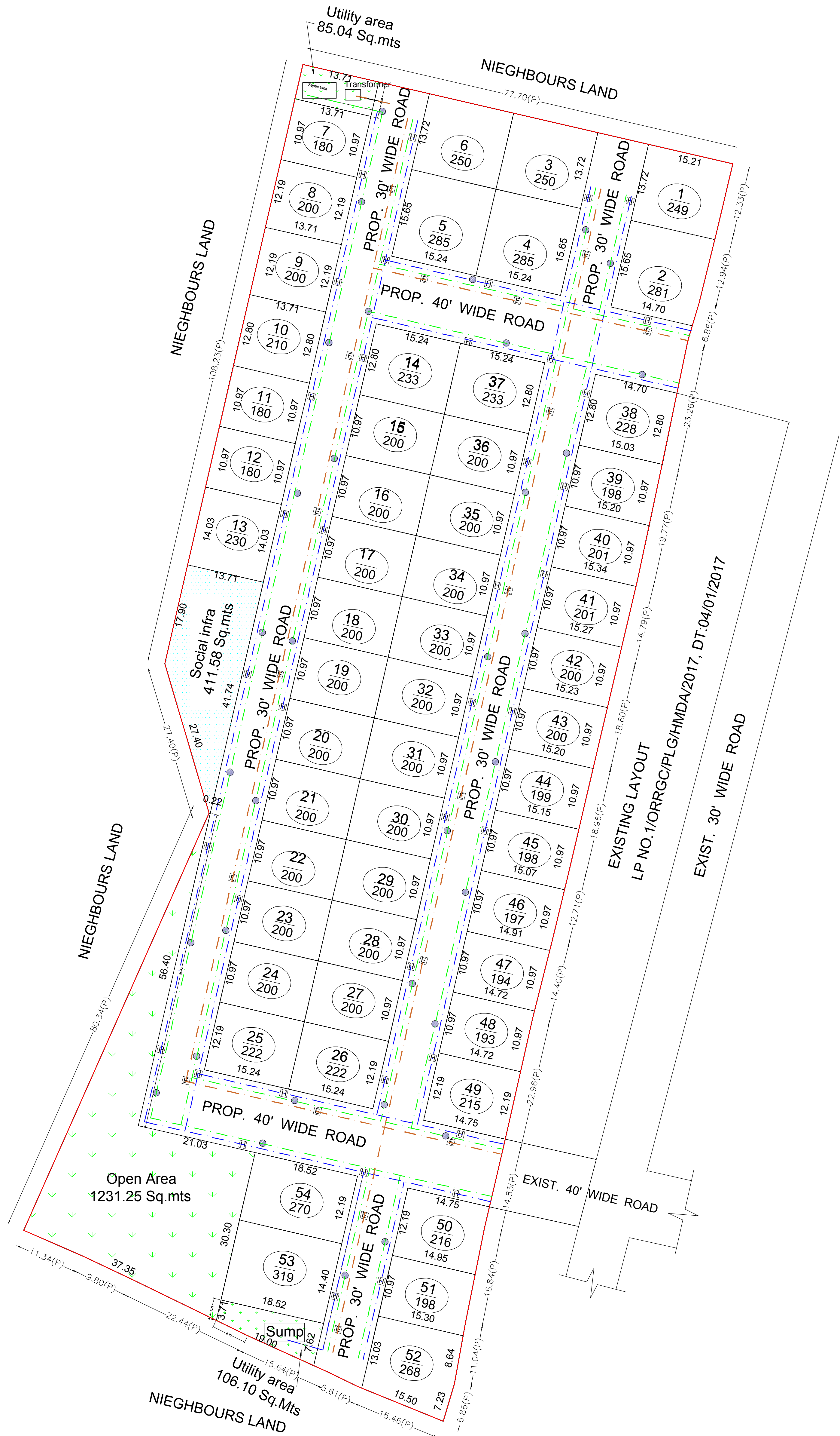
FINAL LAYOUT Scale (1:400)