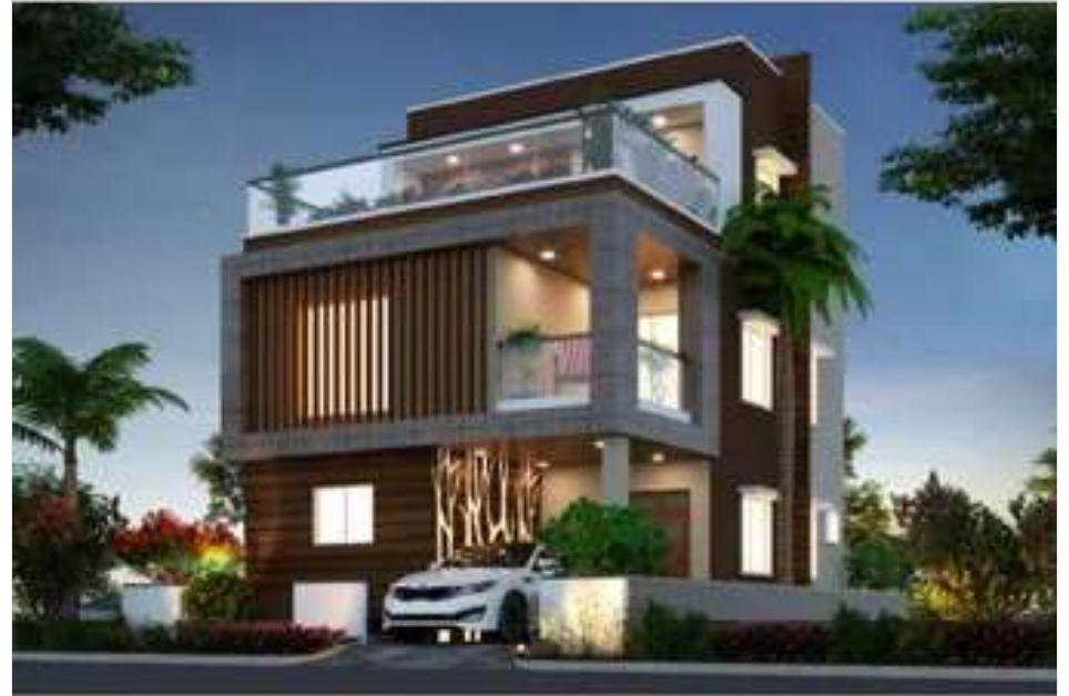
gated community individual houses in hyderabad